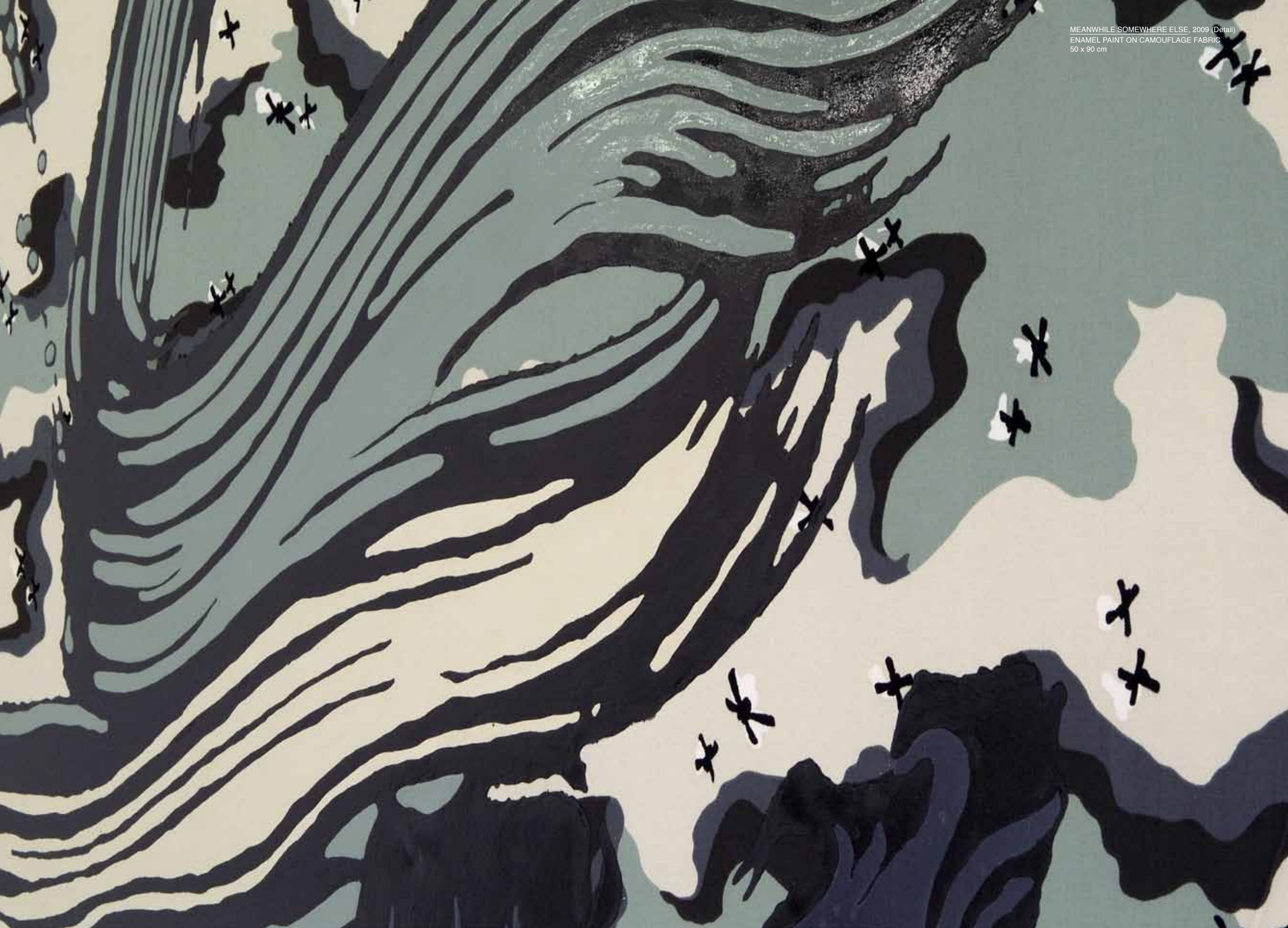
MEANWHILE SOMEWHERE ELSE, 2009 (Detail) ENAMEL PAINT ON CAMOUFLAGE FABRIC 50 x 90 cm