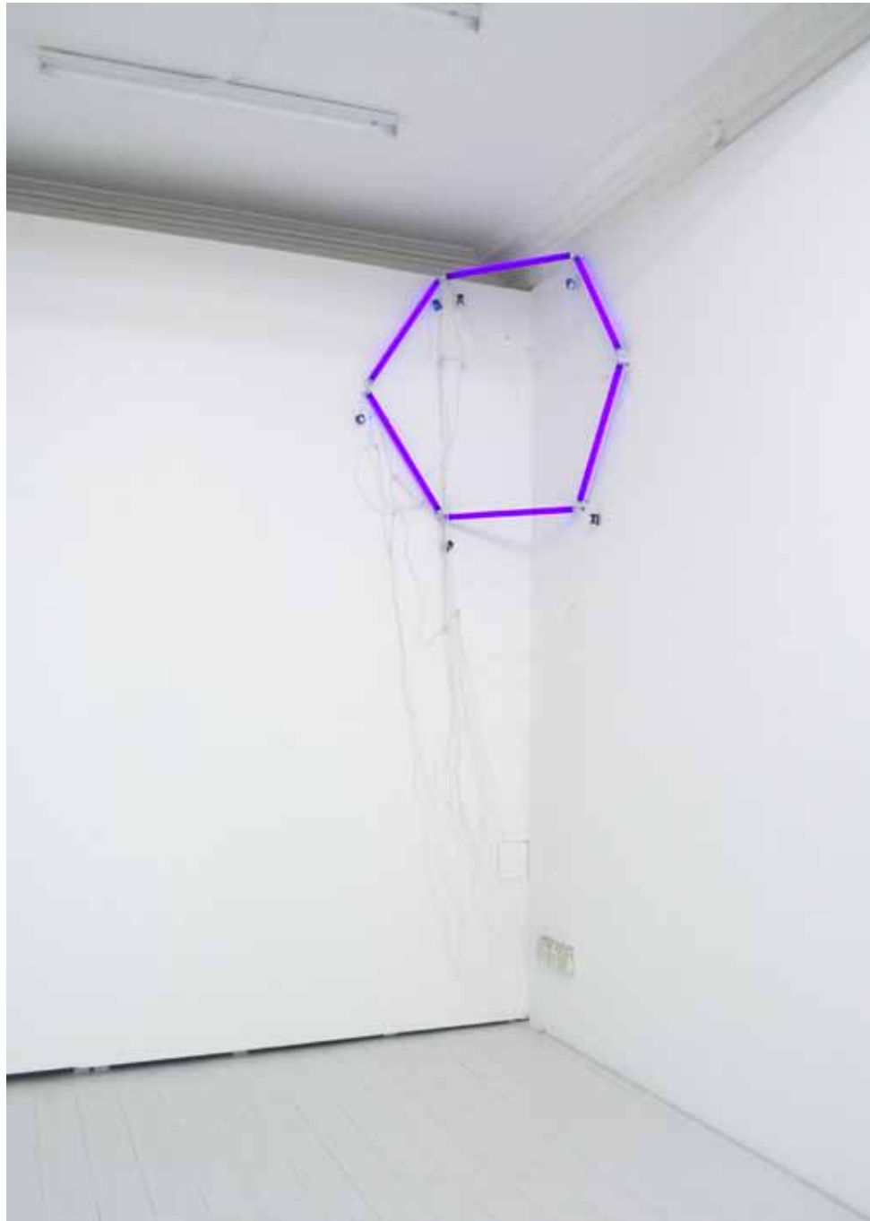
NEW DAWN FADES, 2010 UV LIGHT TUBES ("BLACKLIGHT"), WIRE, FITTINGS VARIABLE DIMENSIONS

Growing older, I have come to understand that this is probably what you eat when drinking tea from Méret Oppenheim's fur cup.