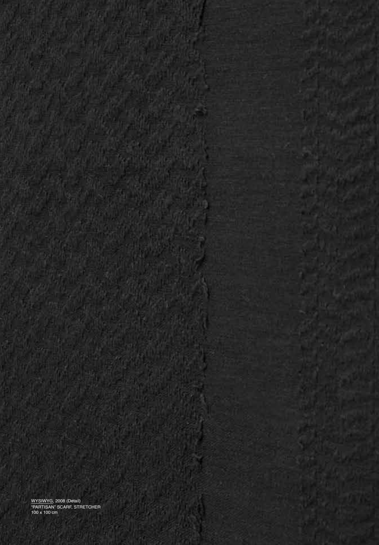
WYSIWYG, 2008 (Detail) "PARTISAN" SCARF, STRETCHER 100 x 100 cm