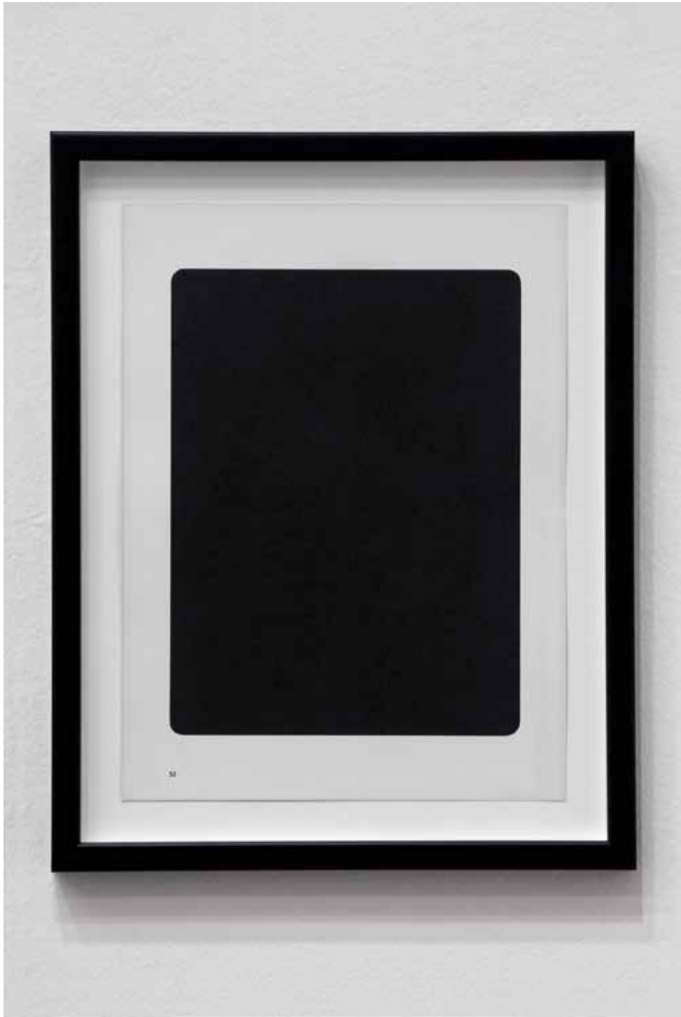
UNTITLED (END OF ORGY), 2009 DEFACED PAGE FROM THE BOOK LIFE, LOVE, DEATH, AND OTHER SUCH TRIFLES BY JAN SAUDEK ARTIST'S FRAME 29 x 36 cm