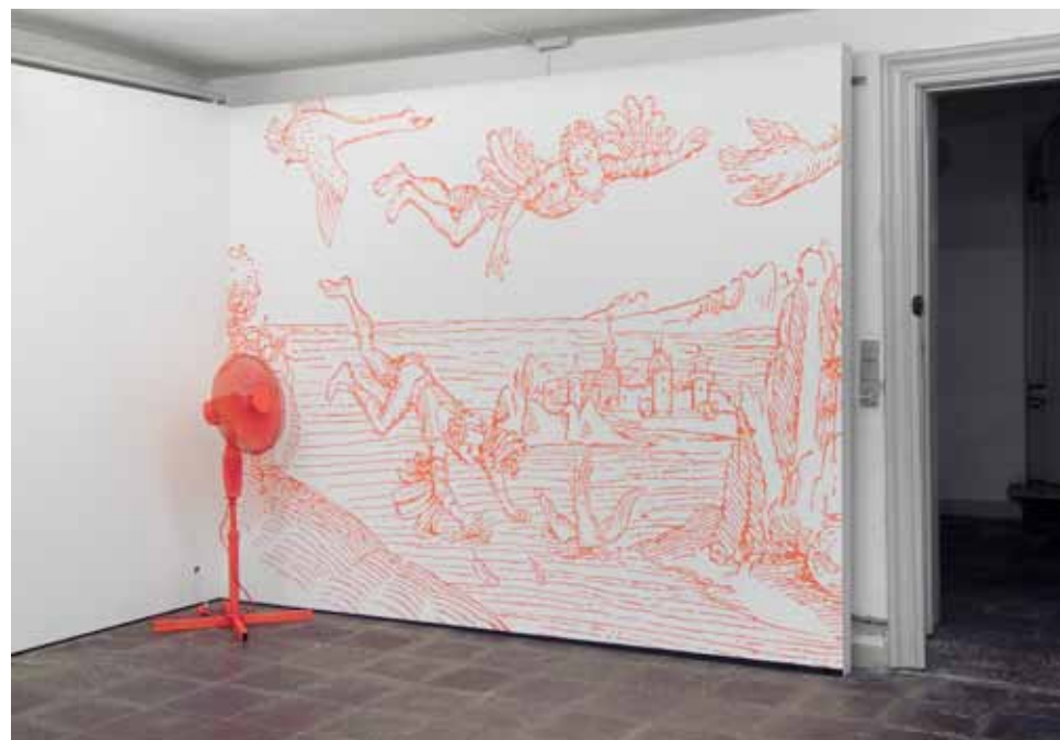
PLAYBOY OF THE WESTERN WORLD, 2009 (AFTER THE ICAROS WOODCUT BY ALBECHT DÜRER) ROTATING ELECTRIC FAN, FLUORESCENT ACRYLIC PAINT VARIABLE DIMENSIONS