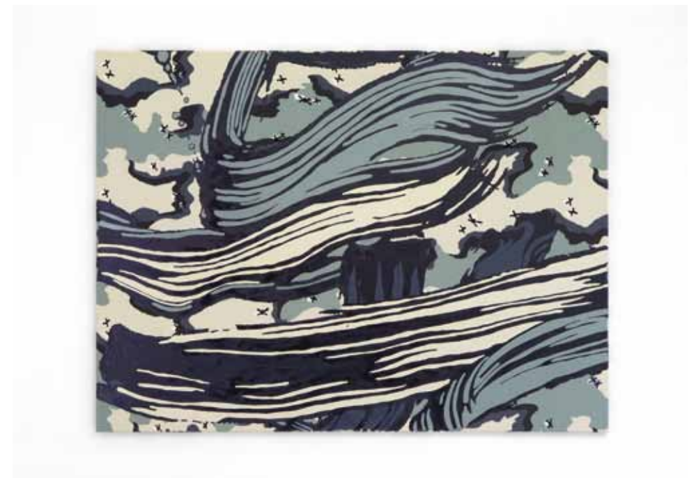
MEANWHILE SOMEWHERE ELSE, 2009 ENAMEL PAINT ON CAMOUFLAGE FABRIC 50 x 90 cm