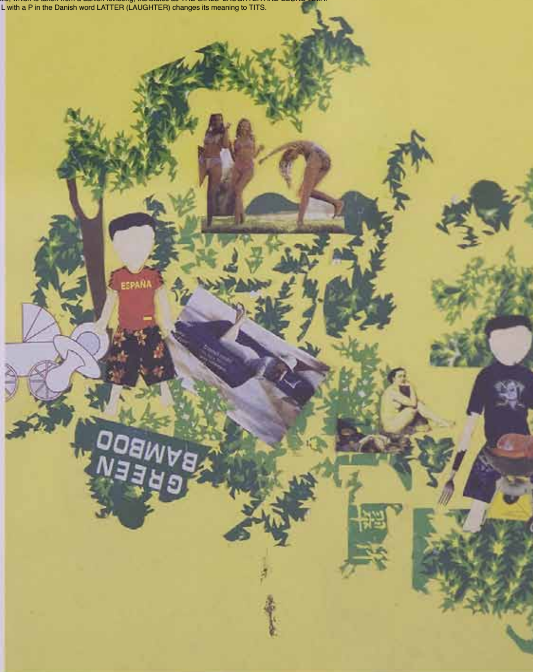
PIGERNES P ATTER OG LYSE HÅR 2004 Papirer, collage, 62x44 cm.

*The original title, which is taken from a danish folksong, translates as THE GIRLS' LAUGHTER AND BLOND HAIR . Replacing the L with a P in the Danish word LATTER (LAUGHTER) changes its meaning to TITS.