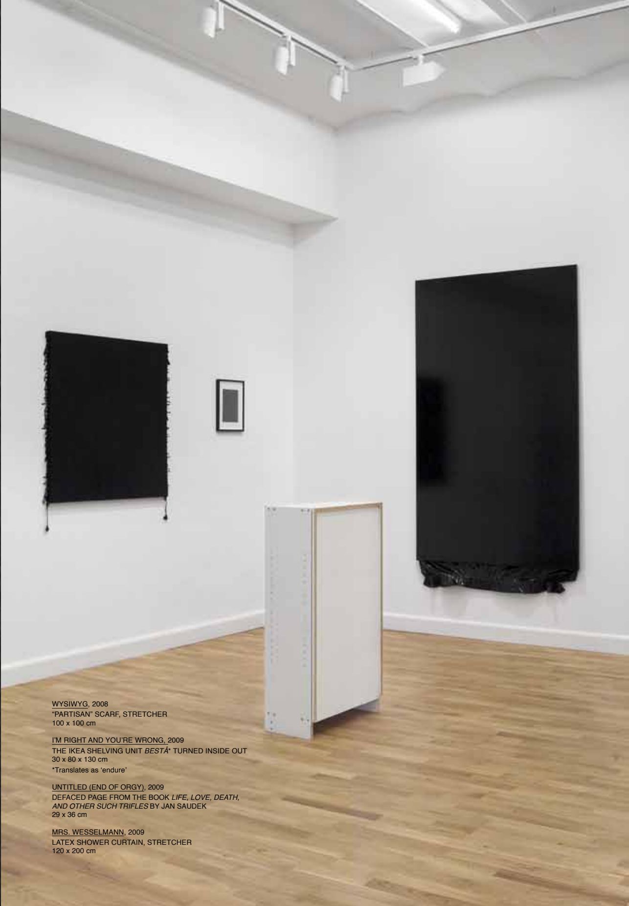
WYSIWYG, 2008 "PARTISAN" SCARF, STRETCHER 100 x 100 cm