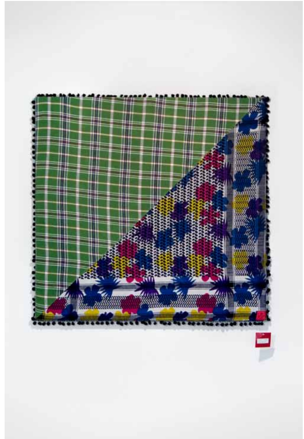
KING OF CONVENIENCE, 2009 ERFURT SCARF FROM THE COLLECTION ARAFAT REMIXES, STRETCHER 90 x 92 cm