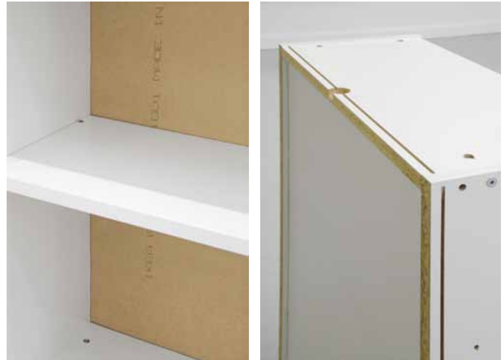
I'M RIGHT AND YOU'RE WRONG, 2009 THE IKEA SHELVING UNIT BESTÅ * TURNED INSIDE OUT 30 x 80 x 130 cm *Translates as 'endure'