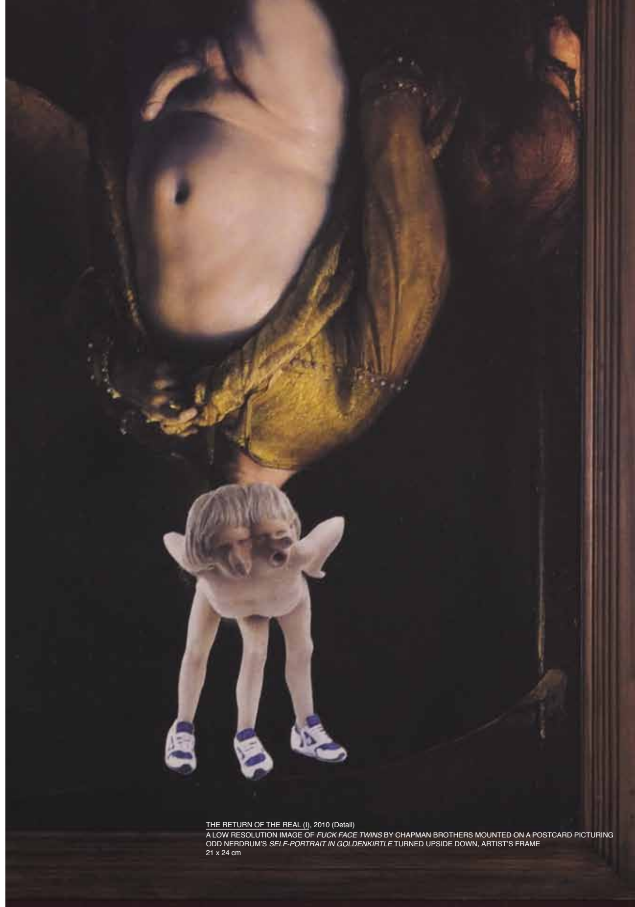
THE RETURN OF THE REAL (I), 2010 (Detail) A LOW RESOLUTION IMAGE OF FUCK FACE TWINS BY CHAPMAN BROTHERS MOUNTED ON A POSTCARD PICTURING ODD NERDRUM'S SELF-PORTRAIT IN GOLDENKIRTLE TURNED UPSIDE DOWN, ARTIST'S FRAME 21 x 24 cm