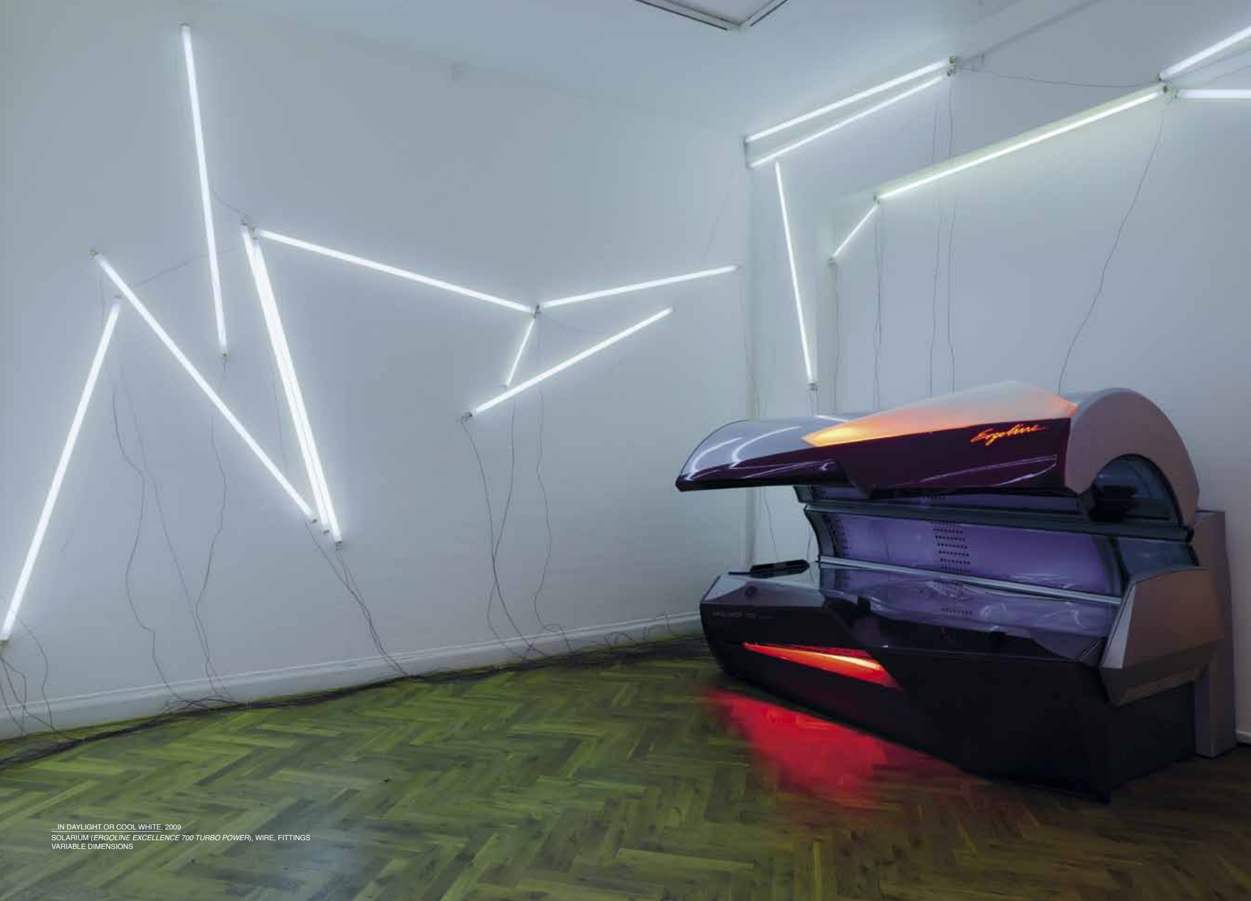
...IN DAYLIGHT OR COOL WHITE, 2009 SOLARIUM (ERGO LINE EXCELLENCE 700 TURBO POWER), WIRE, FITTINGS VARIABLE DIMENSIONS