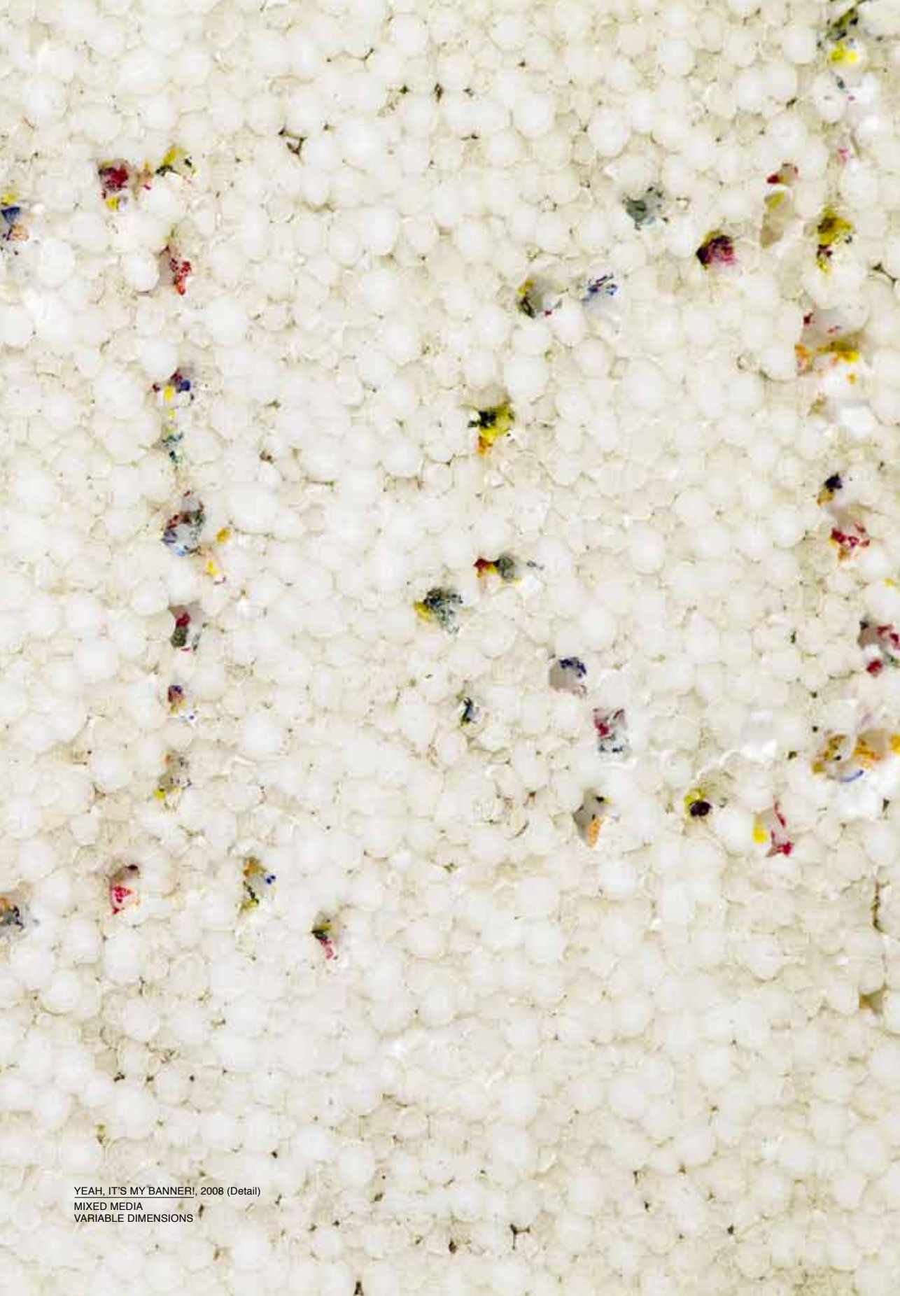
YEAH, IT'S MY BANNER!, 2008 (Detail) MIXED MEDIA VARIABLE DIMENSIONS