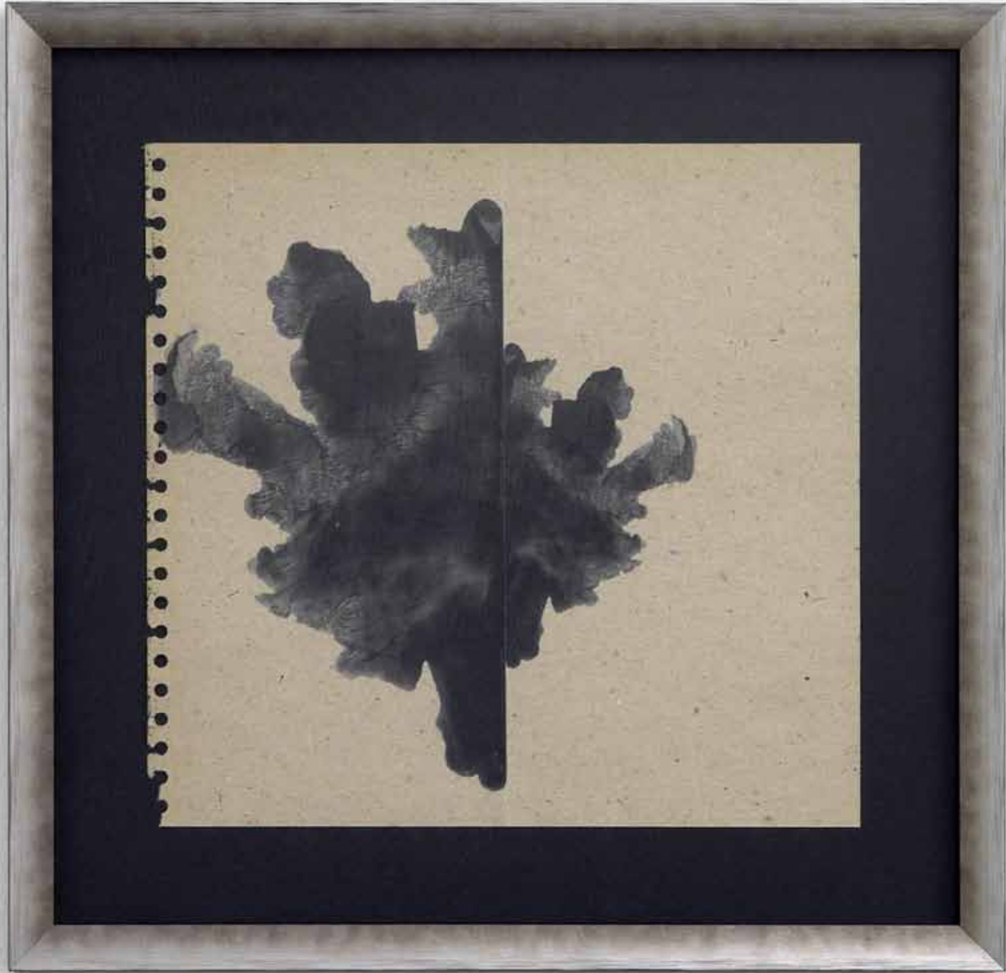
SEXY BEAST, 2008 INKJET PRINT ON PAPER, ARTIST'S FRAME 43 x 43 cm