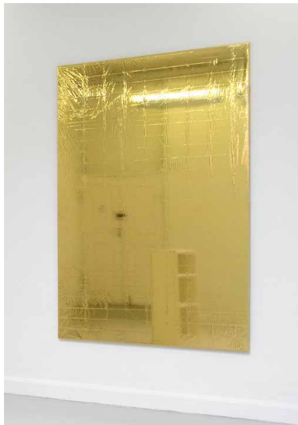
EVIL IS IN THE EYE OF THE BEHOLDER, 2009 MYLAR EMERGENCY BLANKET, STRETCHER 120 x 190 cm