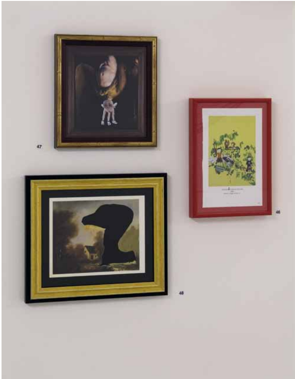
THE RETURN OF THE REAL (I), 2010 LOW RESOLUTION IMAGE OF FUCK FACE TWINS BY CHAPMAN BROTHERS MOUNTED ON A POSTCARD PICTURING ODD NERDRUM'S SELF-PORTRAIT IN GOLDENKIRTLE TURNED UPSIDE DOWN, ARTIST'S FRAME 21 x 24 cm