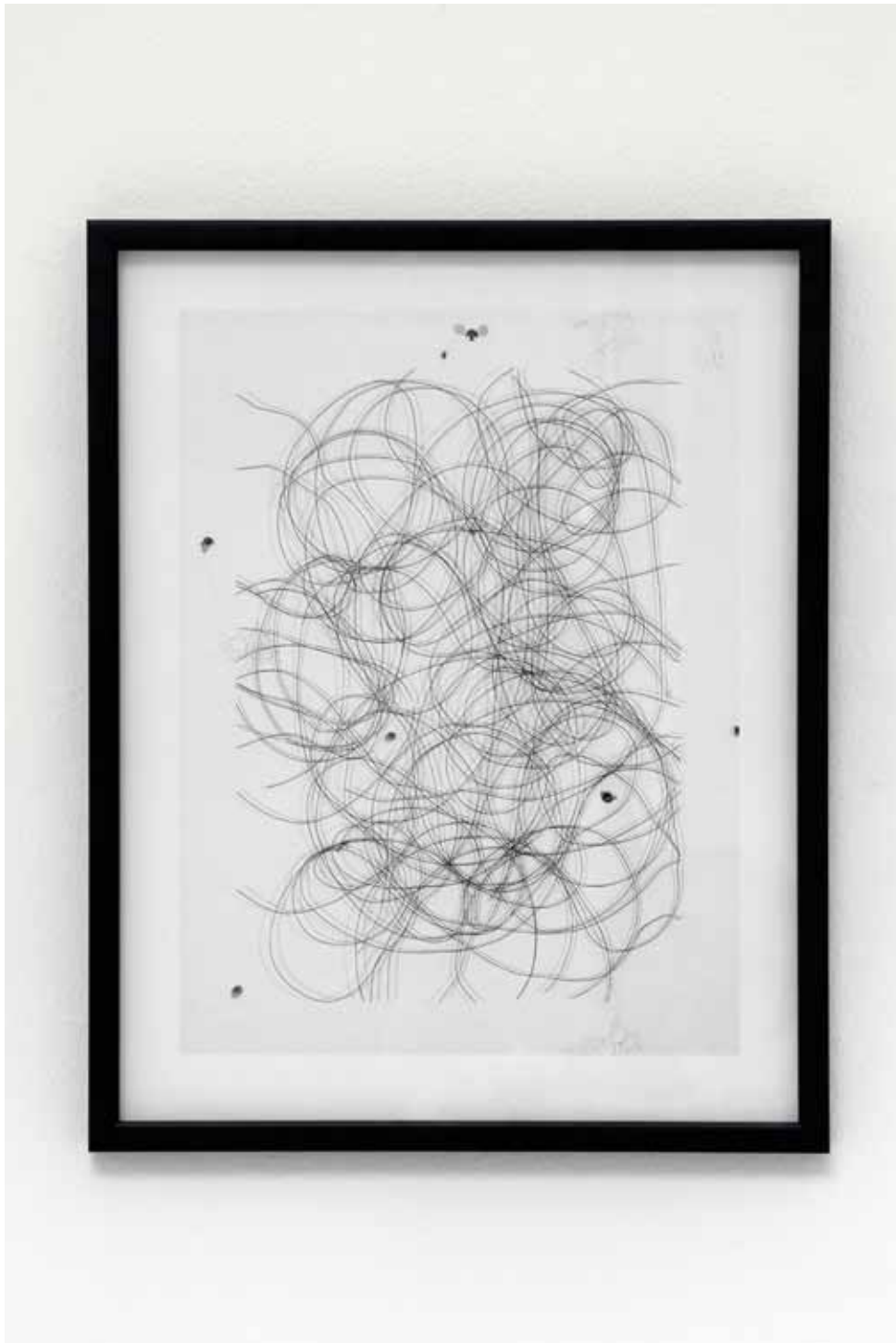
WALL DRAWING (STUDIO), 2009 INKJET PRINT ON PAPER, ARTIST'S FRAME 30 x 40 cm