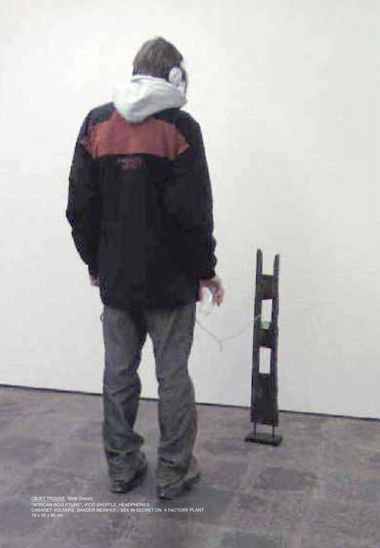
OBJET TROUVÉ, 2008 (Detail) "AFRICAN SCULPTURE", IPOD SHUFFLE, HEADPHONES CABARET VOLTAIRE: BAADER MEINHOF / SEX IN SECRET ON A FACTORY PLANT 16 x 20 x 90 cm