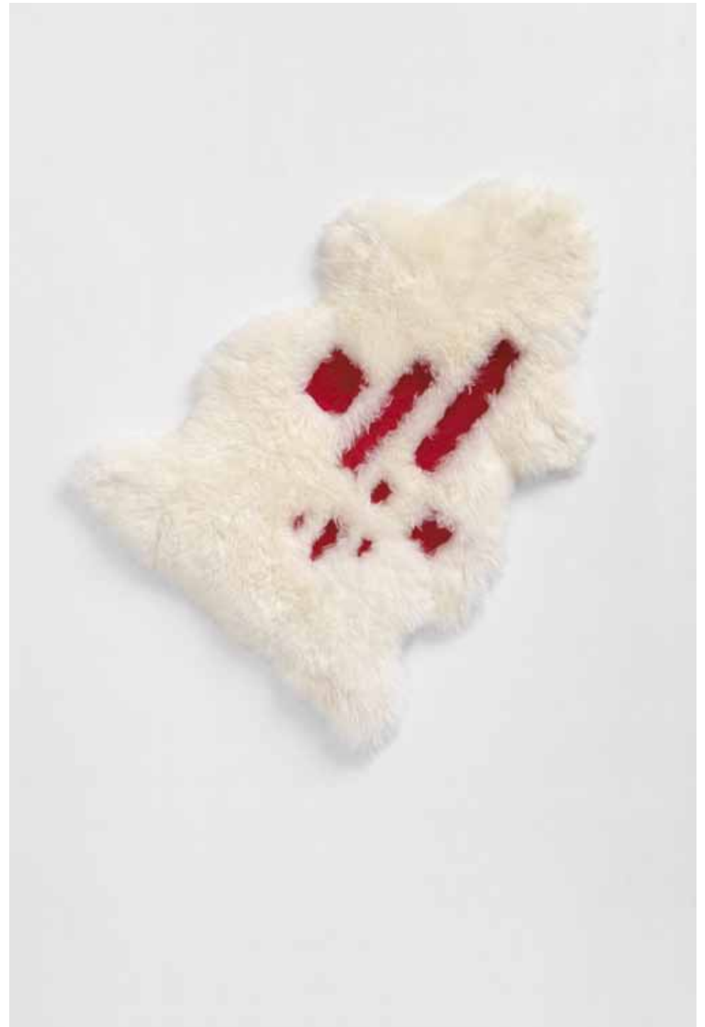
BACK TO THE FUTURE, 2009 OIL PAINT ON SYNTHETIC LAMB SKIN 55 x 87 cm